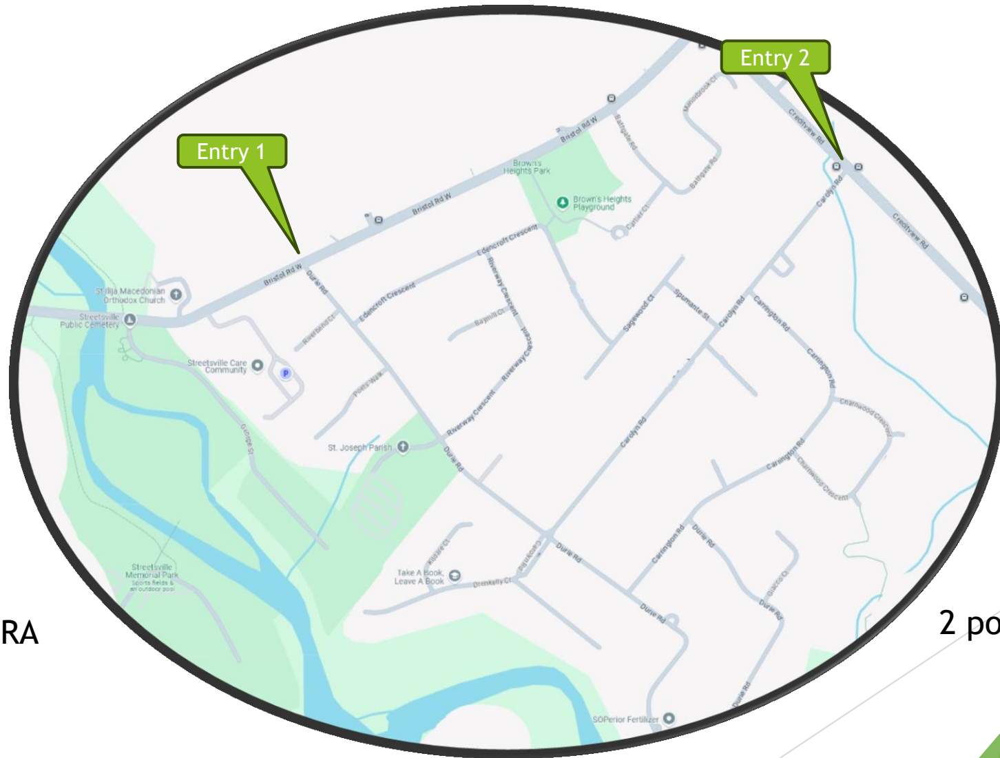
Map of HHRA